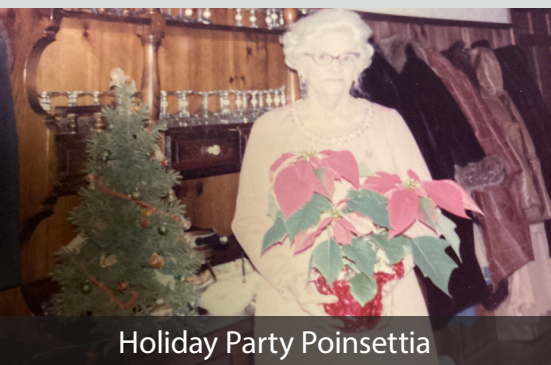
Holiday Party Poinsettia