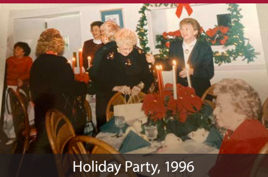
Holiday Party, 1996