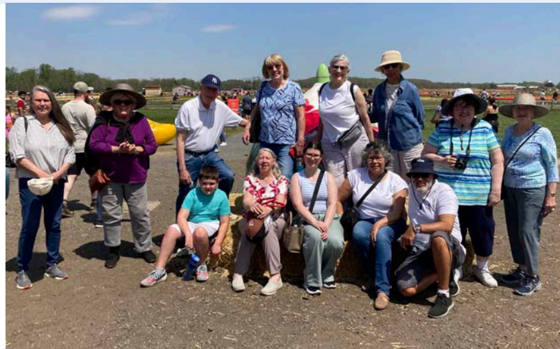
WTGC Members and friends visit Holland Ridge Farms