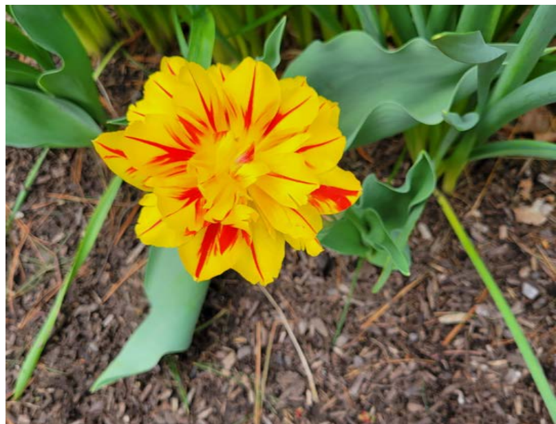
A beautiful spring tulip.