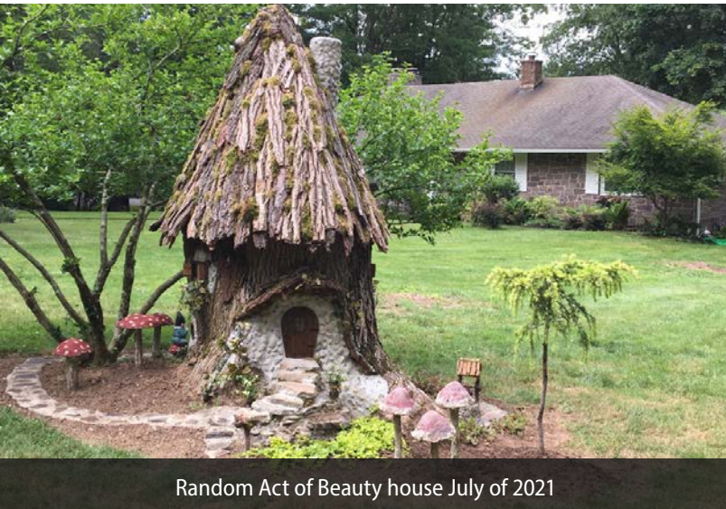
Random Act of Beauty house July of 2021