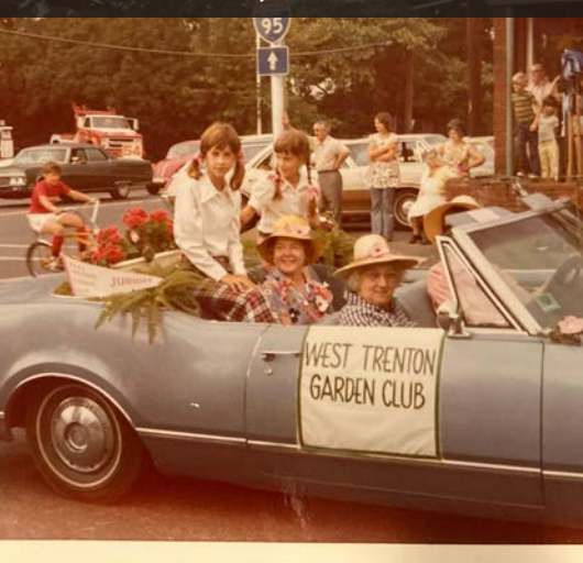
4th of July Parade, 1970s